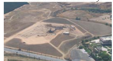
Monte De Oro

What does this mean to Founding Member Wine Club participants? Your initial Wine Club shipment will include the limited edition OGB owners’ labeled wine. Your shipment will then include OGB’s brand new Monte De Oro labeled wine.