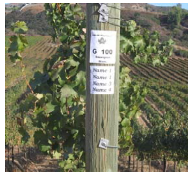
Name on Vineyard Row