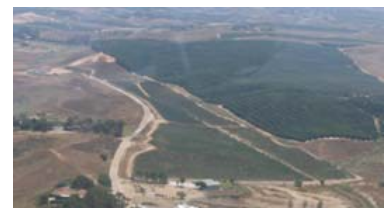
Vista del Monte

OGB Partners is the parent organization for two underlying operations: 1) Grape Vineyards, and 2) a Winery. OGB’s grape vineyards include Vista del Monte Vineyards, De Portola Vineyards, and Galway Vineyards. OGB’s winery operation, which is now under development, will include Monte De Oro Winery and Monte De Oro Vineyards.