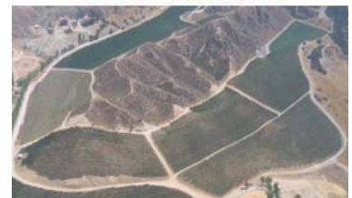
DePortola & Galway

Currently, all of the formal licenses and permits required for one to be in the wine business are held under the name of OGB Partners, LLC. As such, all of OGB’s red wine production (up to and including the 2005 vintage) and white wine production (up to and including the 2006/07 vintage) has been bottled under OGB’s owners wine label- an elegant, limited-edition label designed specifically for OGB’s 65 investor-members. OGB Partners will unveil and begin using its new Monte De Oro wine label in early 2009 for its 2006 red vintage and 2007/08 white vintage and all vintages going forward. In effect, a transition will take place in evolving OGB’s wine identity from OGB Partners to Monte De Oro Winery as licenses and permits are transitioned and put in place for the winery itself.