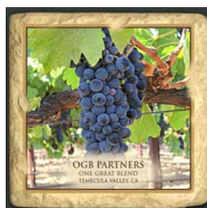
Coasters – 4X 4 inches