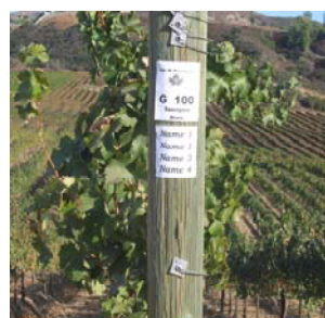
Name on Vineyard Row