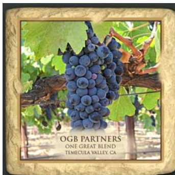
Coaster – 4X4 inches