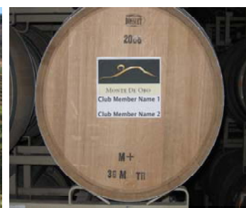
Name on Wine Barrel 2009